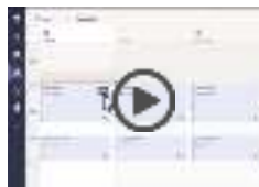
Join a Meeting