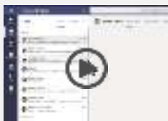
Connect with Classes