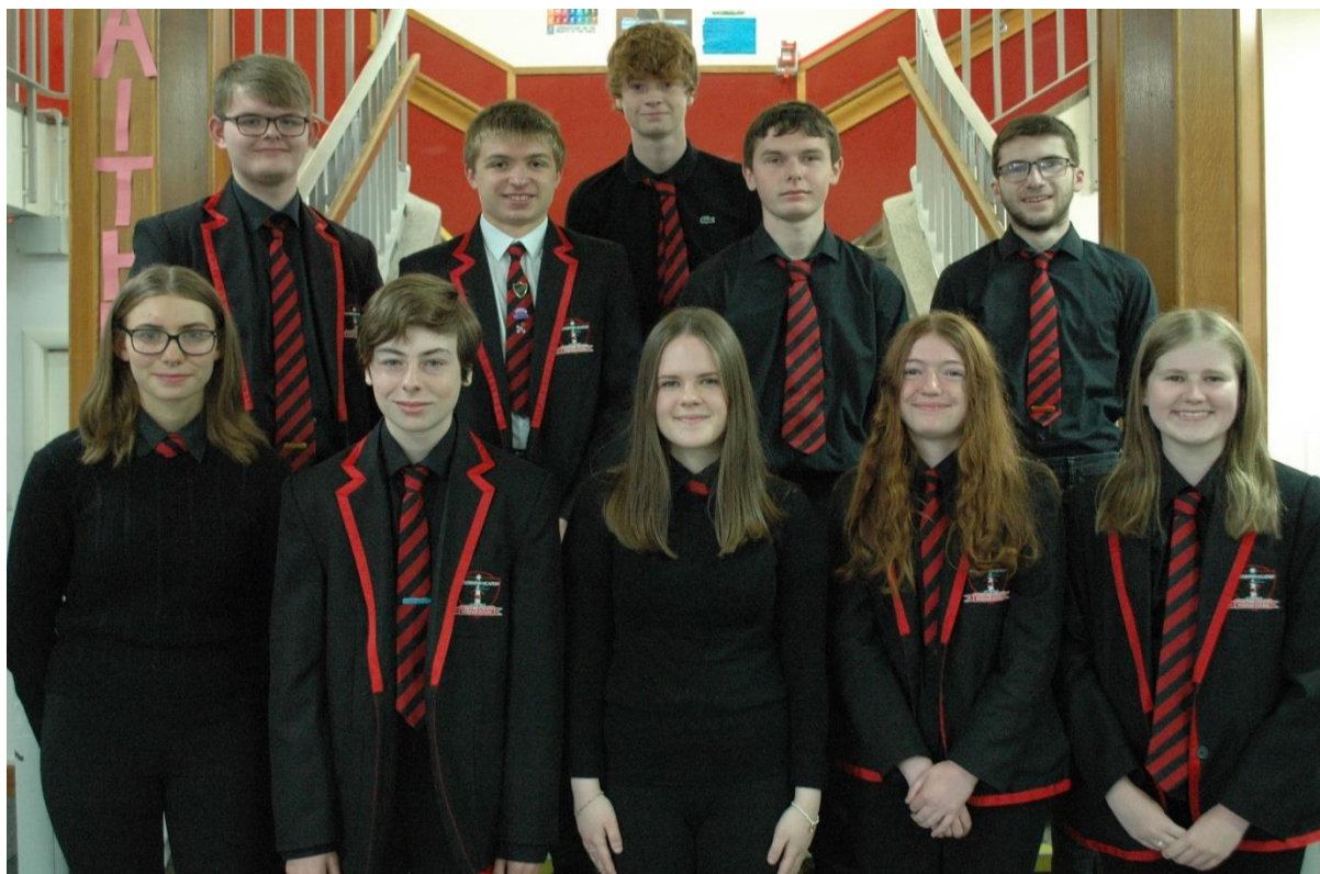
Our top attainers.

We thank all our hard-working and dedicated teachers who have facilitated this success.